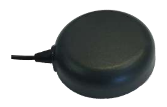
TW7970 Dimensions (mm)

This product is also available in an OEM format (TW3967 for 28dB and TW3972E for 35dB)